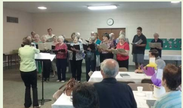
Hymn Sing at Toccoa Presbyterian in June

CVS will be giving free flu shots here at the Church one Sunday in October. More details as the time draws near.